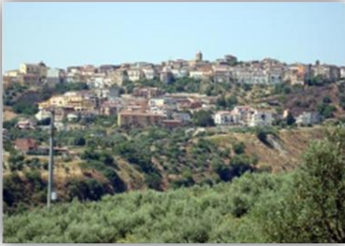
Terranova da Sibari